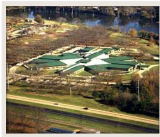
6700 Hwy 165 North, Monroe, LA 71203