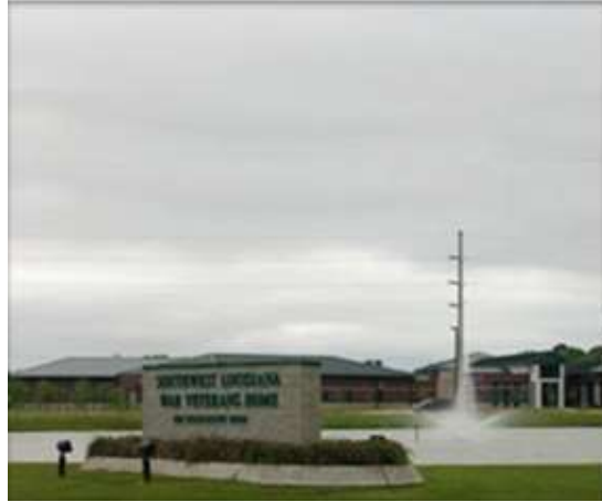
1610 Evangeline Rd, Jennings, LA 70546

This 156 bed facility opened on November 14, 2004 and is located on 40 majestic acres in Jennings, Louisiana. Features include a 4½ acre fishing lake with pier, large chapel and an activities building complete with a sports and game lounge and provides complete medical care including skilled nursing, physical therapy, occupational therapy, speech therapy, Alzheimer/Dementia care, and transportation services. Go to https://www.vetaffairs.la.gov/wp-content/uploads/Strategic-Plan-FY20-FY25-Jennings.pdf to View the SW LA Veterans Home's 2020 thru 2025 Strategic Plan.