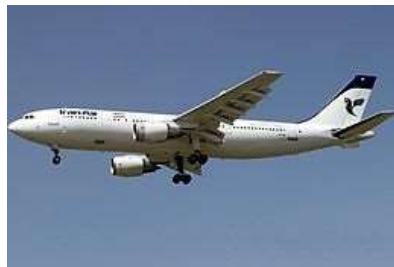
USS Vincennes and a similar A300B2-200