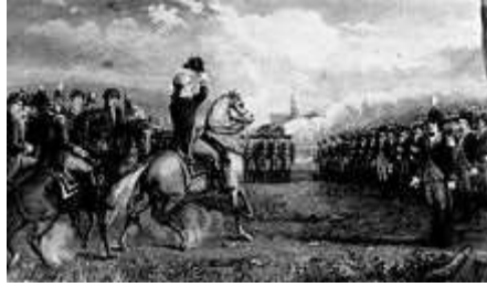
George Washington taking command of the Army.