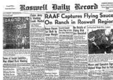
Roswell Daily Record announcing the "capture" of a "flying saucer."