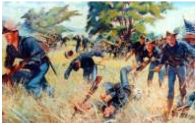
Gatling guns hauled by mules arrive to turn the tide at San Juan Hill