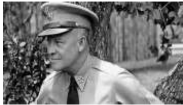
Dwight D. Eisenhower