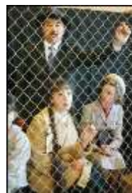
The Manzanar Relocation Center, a one of the concentration camps where Japanese-Americans were forced to live throughout World War II.