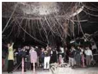
Visitors tour the Amiriyah Bunker. The Iraqi government has preserved the bunker as a public memorial.