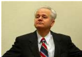
Slobodan Milosevic during his war crimes trial