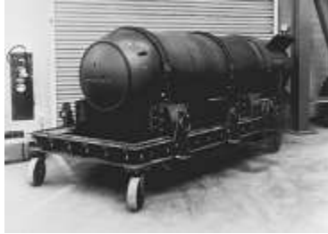
A Mk 15 nuclear 7600 pound bomb