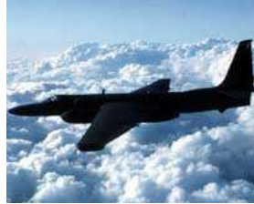
U-2 Spy Plane