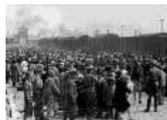
Mengele sometime before 1945 and "Selection" of Hungarian Jews on the ramp at Auschwitz-II (Birkenau), May/June 1944 during which he sought subjects for his experiments