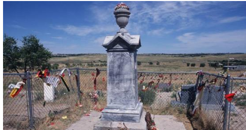
Wounded Knee Memorial