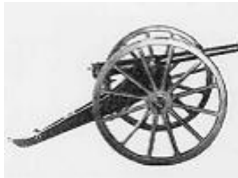
A Hotchkiss 42 mm gun