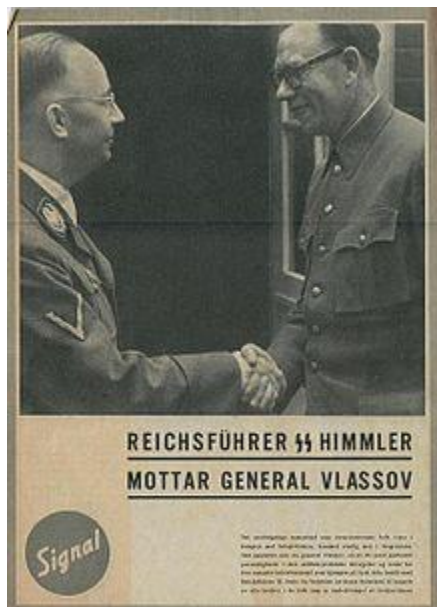
Vlasov and Himmler