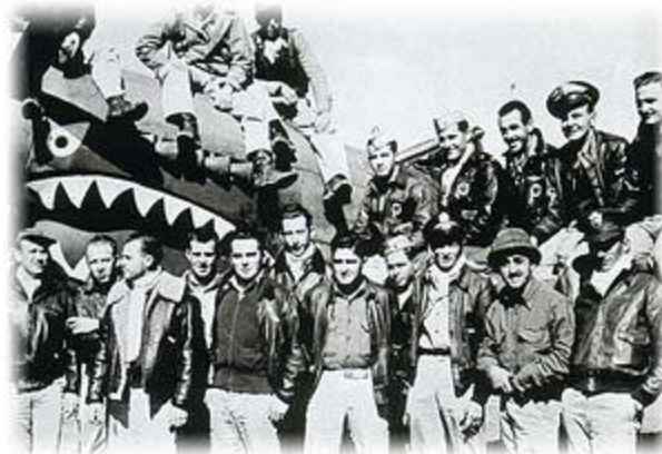
1st American Volunteer Group