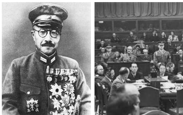
Hideki Tojo (left) before the International Military Tribunal (right) for the Far East