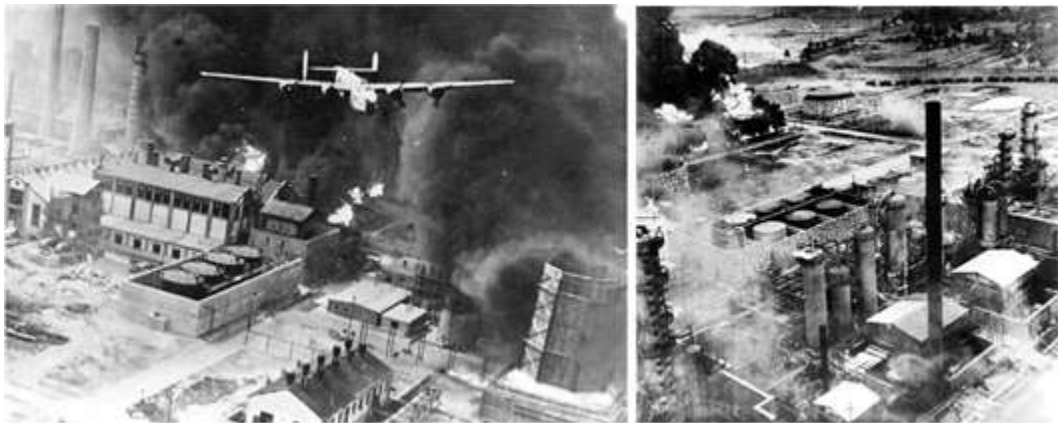
B-24 Liberator Sandman (left), silhouetted against smoke from a bombed factory in Ploesti, Romania during the Allied raid of Aug 1, 1943. The Aquila refinery (right), known to pilots as White Five, in flames as a result of the raid.