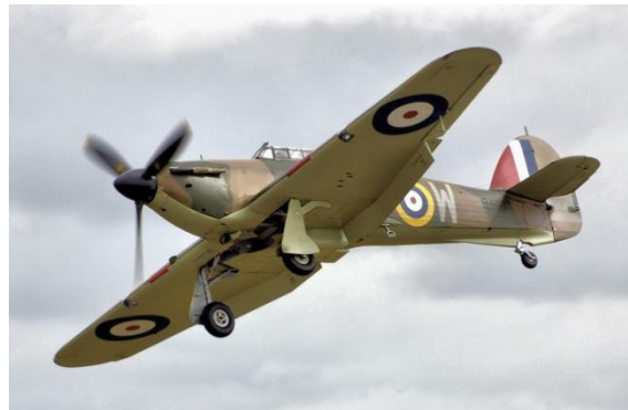
The only Hawker Hurricane from the Battle of Britain still flying today is this Mk 1, which flew 49 combat sorties from its base at Croydon, England. Its pilots destroyed three enemy aircraft and damaged two others.

The fighting did not end on September 15, although it soon became recognized as the day the Luftwaffe lost the Battle of Britain. As for Operation Sea Lion, the proposed invasion of Britain, Hitler postponed it indefinitely. London would suffer from the Blitz as bombing raids continued throughout October. Historians often cite October 31 as the date on which the actual Battle of Britain concluded. RAF losses were 1,017 planes and 537 pilots in Fighter Command and 248 planes and nearly 1,000 men from Bomber and Coastal Commands. The Luftwaffe lost 1,733 planes and nearly 3,000 crewmen.