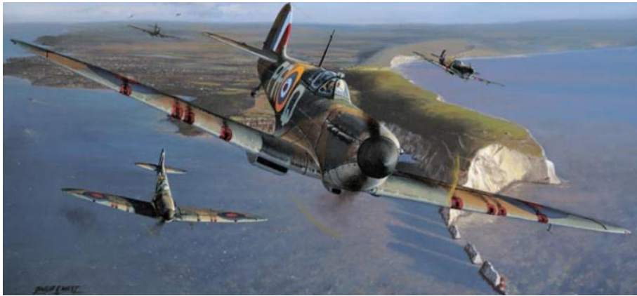
The British Royal Air Force saved its island nation from invasion during the dark days of 1940 and the Battle of Britain.

It was a battle fought without armies. No rifles, no tanks, no barbed wire. In the summer of 1940, the skies above Britain served as the battlefield for the British Royal Air Force and the German Luftwaffe. The Nazis had conquered most of Western Europe, and Britain stood alone. The Luftwaffe represented the first arm of the German military juggernaut to take a swing at the British Isles. Its mission was simple: repeat the performances in Poland and France and eliminate the enemy air force. This would facilitate an invasion, which the Germans had no reason to believe would fail.