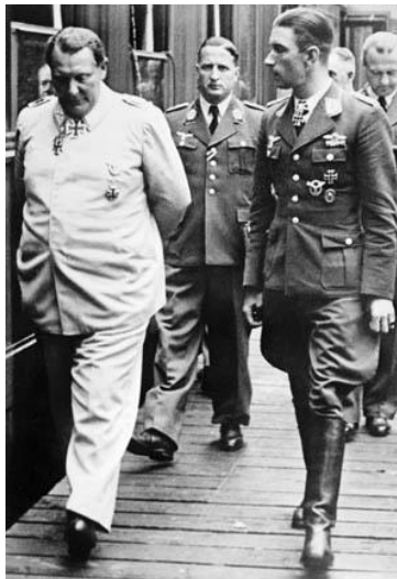
Lieutenant Colonel Werner Mölders, an early German fighter ace, confers with Reichsmarshal Hermann Göring during the Battle of Britain.

Göring hopelessly clung to his admiration of the Bf-110, despite the obvious fact that single-engine fighters were vastly superior. Eventually, Bf-110s were escorted by Bf-109s, fighters escorting fighters. This illustrates just how far removed Göring was from the fighting, compared with Keith Park who was flying sorties in his personal Hurricane.