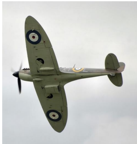
The only Supermarine Spitfire that flew during the Battle of Britain and is still airworthy today is this Mk IIA. The Spitfire became the stuff of legend during the difficult days of the Battle of Britain.

The advantage of radar combined with the excellent climbing characteristics of the Hurricane and Spitfire allowed the British the comfort of being not only in the right spot to intercept, but also at the proper altitude or, if they were lucky, higher. British response tactics were modified by Douglas Bader and Trafford Leigh-Mallory to accommodate the Big Wing theory, which inflicted heavy casualties on the Luftwaffe. Eventually this tactic was adopted as official doctrine.