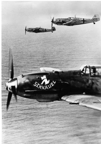
Heading for the coast of England in September 1940, a squadron of German Messerschmitt Me-109 fighters prepares to do combat with the Royal Air Force for supremacy of the air.