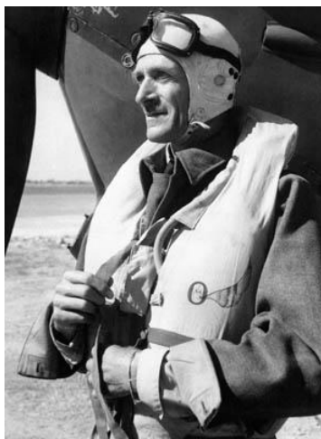
Shown in flight gear before taking off from an airfield on the island of Malta, Air Vice Marshal Sir Keith Park, a New Zealander, played a prominent role in managing Britain's fighter defenses against the onslaught of the German Luftwaffe

From the outset Trafford Leigh-Mallory and Keith Park did not see eye to eye. Park, who flew his personal Hurricane to check up on his pilots in combat, commanded 22 fighter squadrons over the most important area of the country. Leigh-Mallory was assigned to support Park, and his 14 squadrons would cover 11 Group's bases when they went up after the German raiders. Because 11 Group's area was closer to the French coast and held the priority targets, logistics made it more reasonable for Park's fighters to be the first wave of attackers. Nevertheless, this created animosity among Leigh-Mallory, Park, and Dowding. The approaches each man took to thwart the Luftwaffe would directly affect the outcome of the battle.