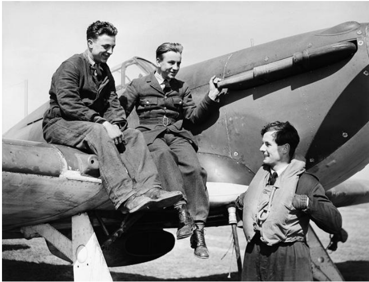
Squadron Leader Peter Townsend chats with two ground crewmen as they sit jauntily atop the wing of his Hawker Hurricane fighter based at Wick, Scotland. The Hurricane proved more effective against German bombers, while Spitfires attacked the enemy fighters during the Battle of Britain.

The difficulty in shooting down a German bomber owed to the inadequacy of the .303 round and to the self-sealing fuel tanks found in German aircraft. The self-sealing tanks worked by employing two layers of metal divided by a special rubber compound. When the tank was punctured, the fuel reacted with the rubber, causing the compound to swell and close the hole. This was only a temporary fix, which would allow the plane to return to base without losing appreciable fuel or bursting into flames.