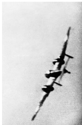
Gun camera footage from the Spitfire flown by Pilot Officer M.E. Staples shows a German Messerschmitt Me-110 fighter frantically banking to port to elude the British pilot’s machine-gun fire. Staples, a pilot of No. 609 Squadron, was one of those who proved the superiority of the Spitfire against most German bombers and twin-engine fighters during the Battle of Britain.

The reason for the effectiveness of RAF interceptions of German bombers was quite simple. The British radar system worked incredibly well. Beginning in the early 1930s, Britain had experimented with radar, and by 1938 the system was so advanced that it could report size, speed, altitude, heading, and whether or not the plane was friendly. The Germans knew about the British radar but chose to ignore it. The towers at Dover could be seen from the French coast. This proximity gave the Germans the false hope that the bombers, even though they showed up on radar, would be able to attack their targets before the information could be passed through the proper channels.