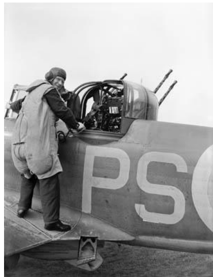
Preparing to enter the gun turret of his Boulton Paul Defiant Mark I fighter at its base at Kirton-in-Lindsey, Lincolnshire, a gunner of No. 264 Squadron, RAF, smiles confidently over his shoulder. The Defiant was obsolete by the time this photo was taken in August 1940.

The Boulton Paul Defiant first appeared in May 1940. Its top speed was 303 mph, and its four machine guns were located in a manned turret immediately aft of the cockpit. This arrangement made it impossible to attack a target in front of the aircraft, as it had no fixed forward firing armament. The turret had been placed in a defensive position.