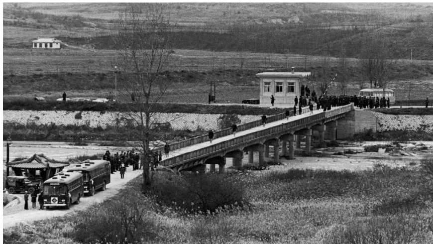
The USS Pueblo crew cross the Bridge of No Return between North and South Korea, after their release into US custody on December 23, 1968.

Eventually, following a press conference staged by the North Koreans with the crew of the Pueblo, which ended with Bucher calling on the US government "to do something to save the lives of these young men," Washington agreed to sign an apology as Pyongyang demanded, provided it be allowed to issue a statement beforehand.