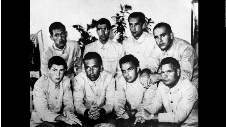
The USS Pueblo crew display their middle fingers in propaganda photos put out by their captors.

Even as negotiations were reaching a breakthrough, the men of the Pueblo came close to dooming themselves.