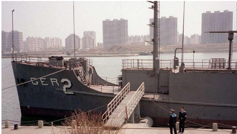
The USS Pueblo seen in Pyongyang, North Korea, on April 16, 2001

A scathing report by the Congressional Committee on Armed Services largely agreed, criticizing the planning of the mission, the lack of support or protection for the Pueblo, and the "absent or sluggish response by military commanders" once the crisis got underway.