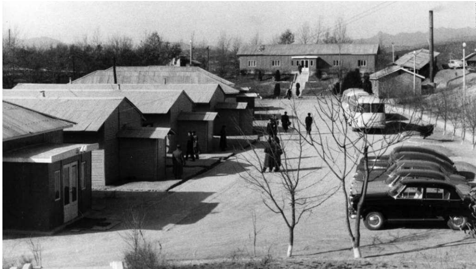
The iconic blue huts in Panmunjom, on the DMZ between North and South Korea, seen in 1965.

One night, after being shown two North Korean propaganda films in which Westerners were seen raising their middle fingers to the camera, the crew realized their captors didn't know what the insulting gesture meant, and started flipping them off at every opportunity, including in staged photos and films.