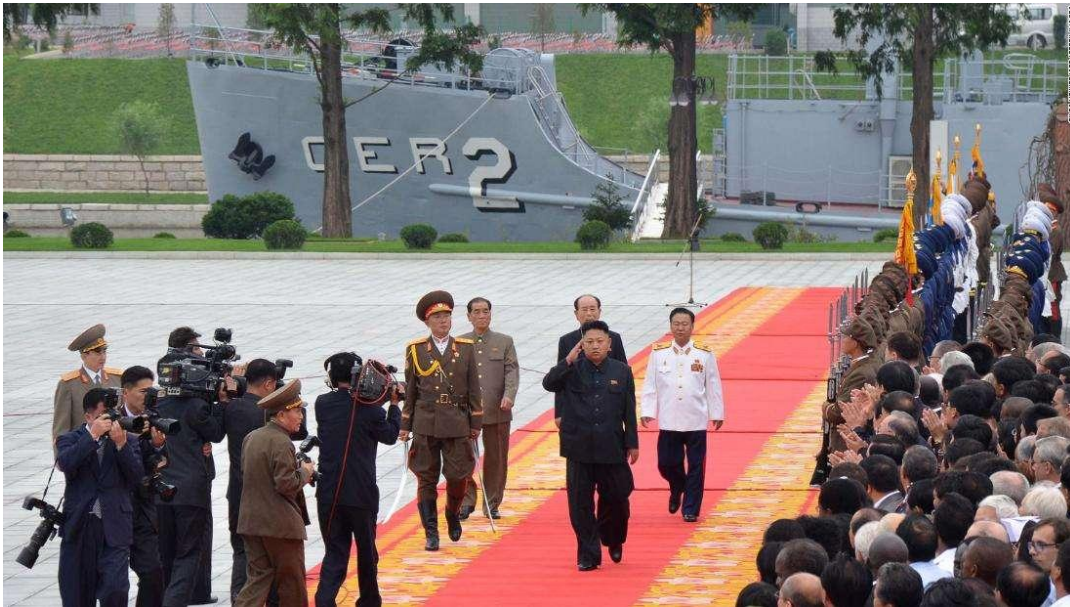
North Korean leader Kim Jong Un salutes as he walks in front of the USS Pueblo in Pyongyang on July 27, 2013.