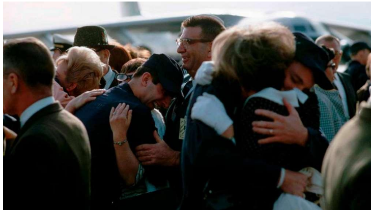
The USS Pueblo crew greet relatives upon returning from captivity in North Korea.

Russell was outside the comms room when one of the officers inside, seeing him standing there, ran out and pulled him to the floor, screaming the North Koreans were about to open fire.