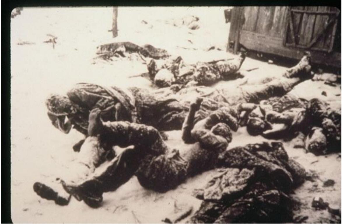
Possible Dead From Hell Fire Valley. The Chinese Stripped The Bodies For Boots And Parkas.