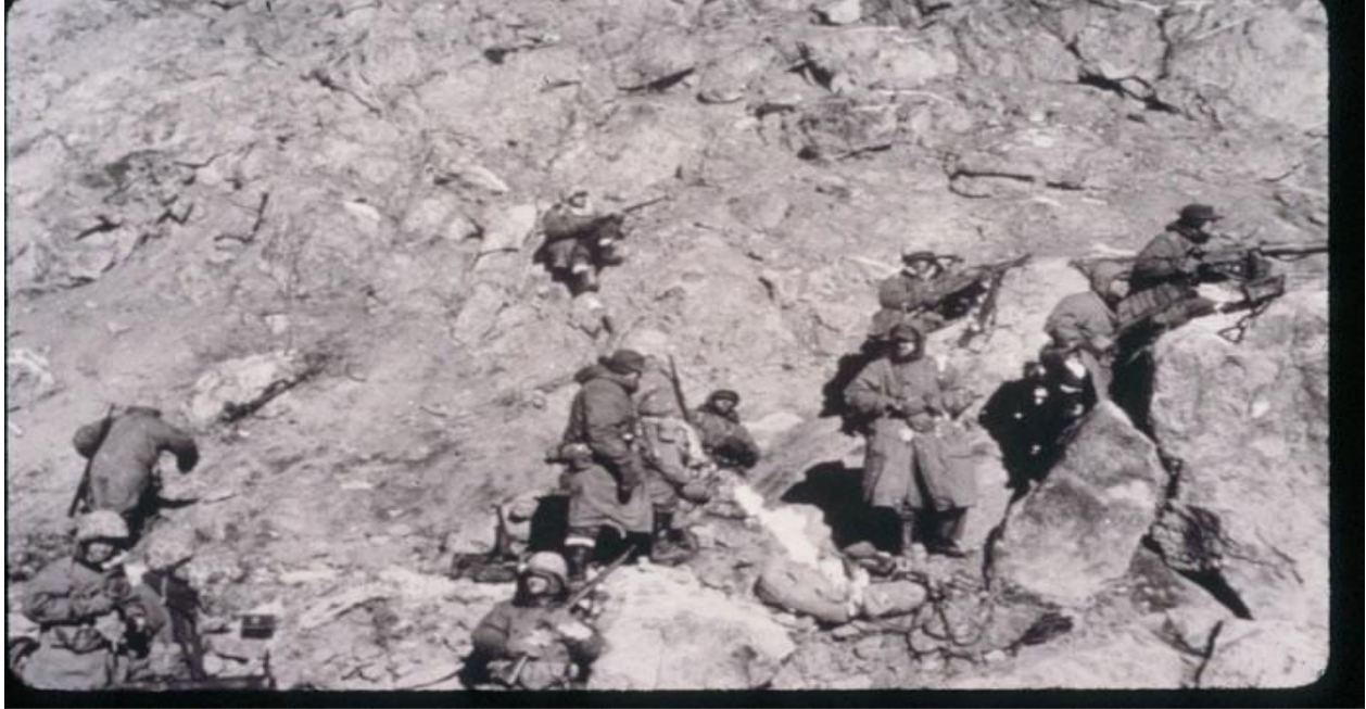
Weapons Company, 2nd Battalion, 7th Marines. Giving Overhead Fire On The Advance Toward Hagaru-ri.