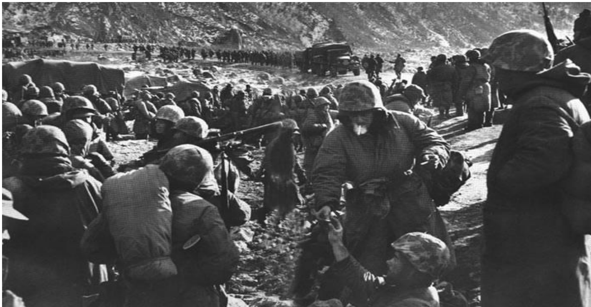
Standing By To Move Out To Koto-ri From Hagaru