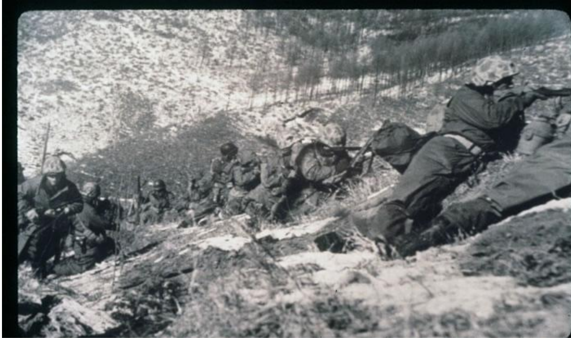
A Base Of Fire And Flank Protection