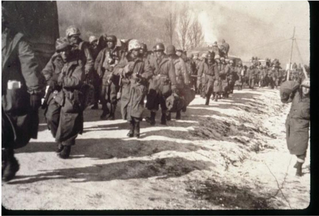
Marines Move North Toward The Yalu And Into The Chosin Reservoir Area.