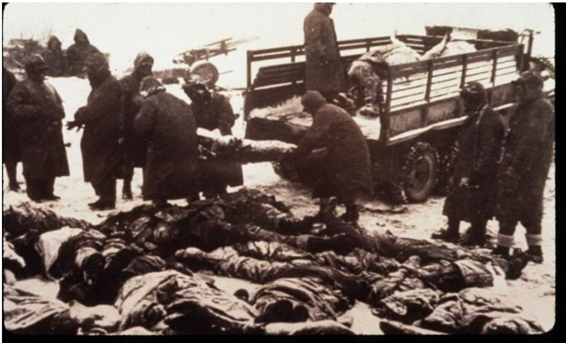
U.S. And British Royal Commado Marines Prepared For Burial At Koto-ri.