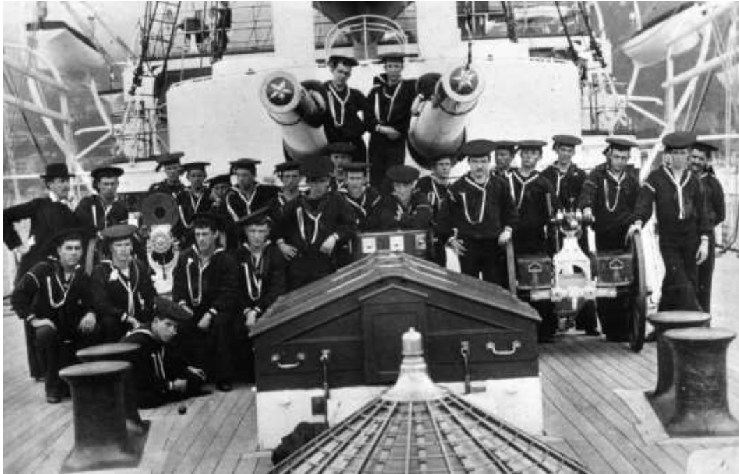
Apprentice boys pictured aboard the USS Olympia, the flagship of the Asiatic Squadron