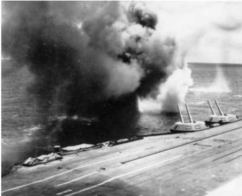
Japanese suicide bomber blows up next to a British aircraft carrier, in the waters off Ryukyu Islands, on May 4, 1945, during the Battle of Okinawa