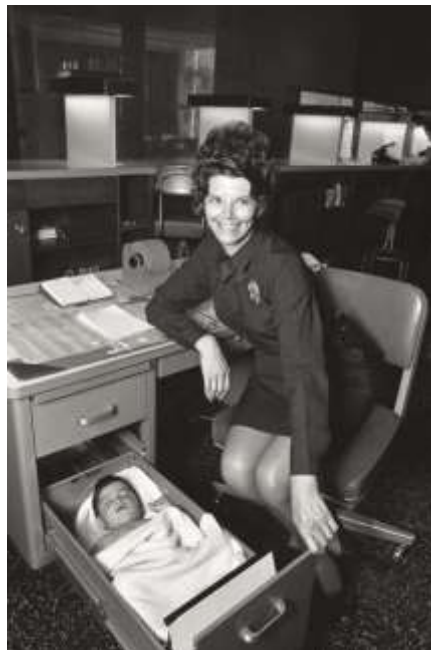
An abandoned baby sleeps peacefully in a drawer at the Los Angeles Police Station, 1971