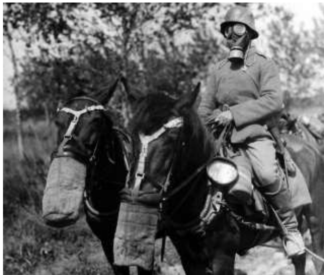
A German ammunition column, men and horses equipped with gas masks, pass through woods contaminated by gas in June of 1918.